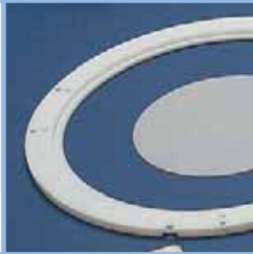
Reactor insulating ring - E-chuck insulating plate